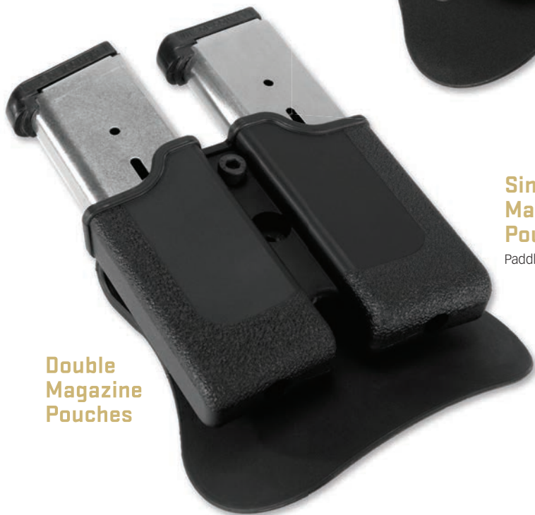
Double Magazine Pouches