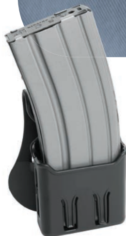
Single AR Mag Carrier

Friction fit for standard GI 20 and 30rd magazines, the paddle configuration is ideal for range use, training, or concealed carry.