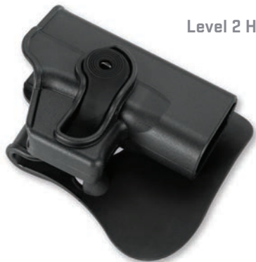
Level 2 Holster