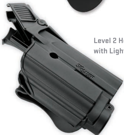
Level 2 Holster with Light