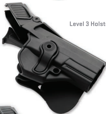
Level 3 Holster