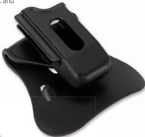
Single Magazine Pouches